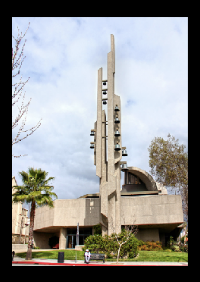
Pasadena Presbyterian Church Pasadena, CA