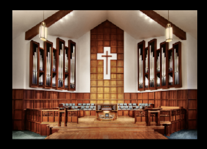
University Presbyterian Church Austin, TX